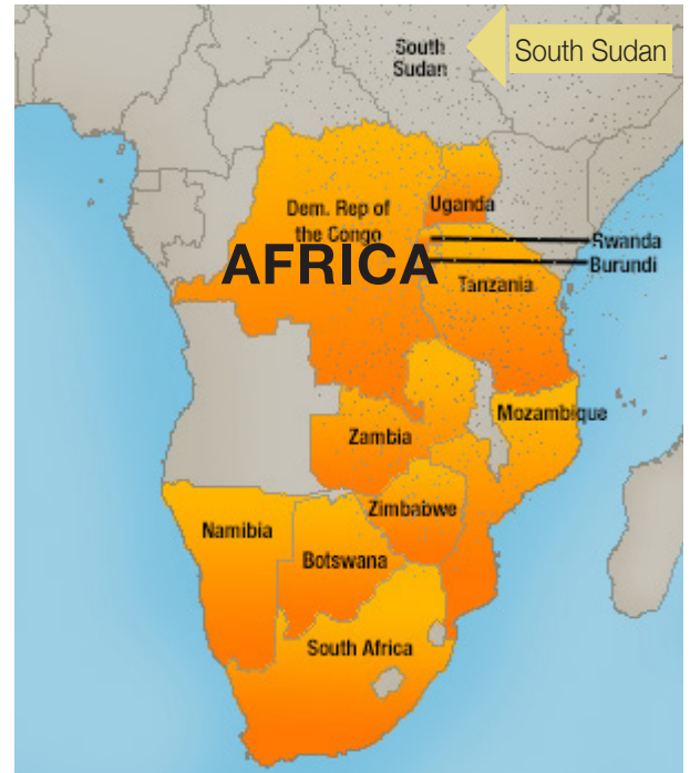
Africa map: the orange colored countries on the map are where Africa Missions already has a network

Thank you to all who help us in this great venture to South Sudan! When you join us with your prayers and financial gifts to uplift, train, and expand the Church of Jesus, you are helping to make things happen!