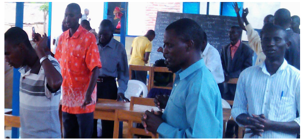
(Above) Rwanda Bible College students having a time of prayer.

2014 enrollment in Burundi, Rwanda, DRC, Uganda, and South Africa is 155 students.